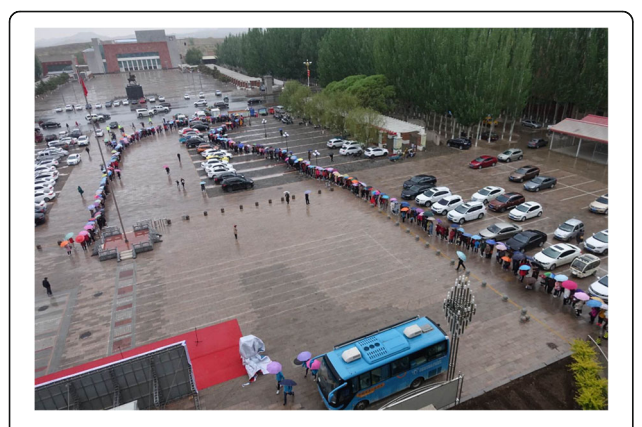
Fig. 2 Health camp approach in the Inner Mongolia Minority Autonomous Region, Photo acknowledgement: Adam Qin

Digital Colposcopy (DC) was performed with the EVA system 90 s after the application of acetic acid. All DC was performed by one of six physicians and the EVA system was used to obtain 1-3 DC images per patient. Thin acetowhite lesions were considered suspicious for CIN1. Thick acetowhite lesions, rapidly appearing